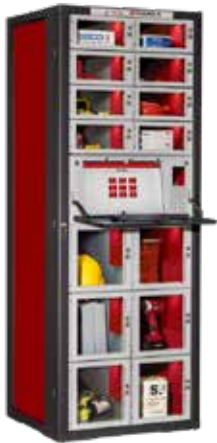
AutoLocker stations provide 24-hour access to high value, oversized, calibrated and durable products.