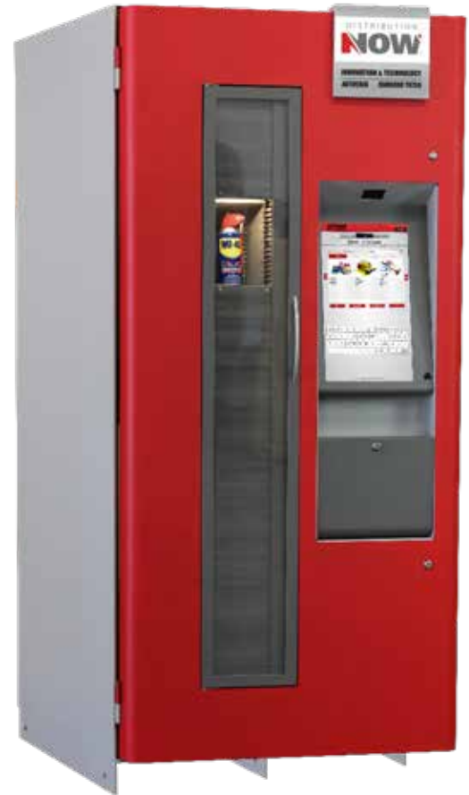
AutoCrib Tambour TX750 - The system in its most dense bin size configuration provides for up to 900 bins.