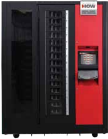
AutoCrib RoboCrib LX2000 - This unit has been designed to provide secure access to over 2,000 different items.