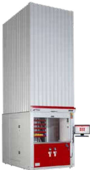
Vertical Lift Module (VLM) is designed to optimize your facility's layout by taking advantage of unused overhead space.